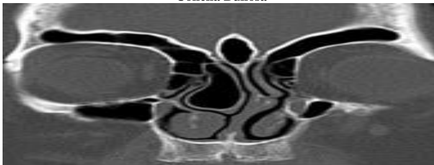
Fig - 2

Concha bullosa (pneumatized middle turbinate) (Fig – 2) has been implicated as a possible aetiological factor in the causation of recurrent chronic sinusitis. It is due to its negative influence on paranasal sinus ventilation and mucociliary clearance in the middle meatus region as quoted by Tonai(22). Concha bullosa was seen in 45.5% of the chronic rhinosinusitis cases which is almost similar to as reported by Bolger et al., and Yousem et al., respectively. Perez-Pinas et al., Scribano et al., reported higher prevalence of concha bullosa i.e.73% and 67% in chronic rhino sinusitis cases. The prevalence of concha bullosa in our study is on the higher side when compared to the findings of Stallmann et al.,(20), Maru et al.,(25). Wani et al., Dua et al., Asruddin et al., Mamatha et al., Zinreich et al., Llyod et al., and Weinberger et al reported further less prevalence of about 36%, 30%, 28%, 16%, 15% 14% and 15% respectively(1,6,19,21,27,29).