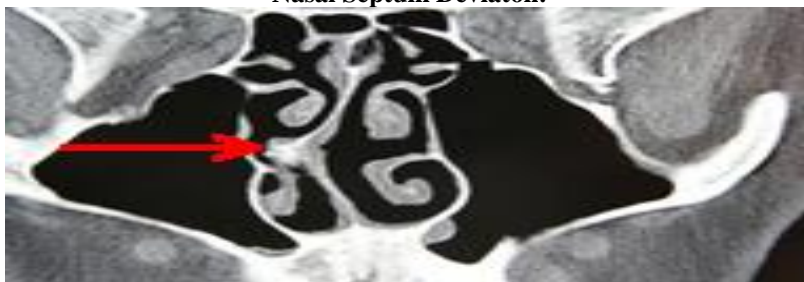
Fig - 1

Nasal septum is fundamental in the development of the nose and paranasal sinuses. It is the epiphyseal platform for the development of the facial skeleton. 73.2% of the patients in our study presented with nasal septal deviation (Table/Fig-1). Deviated nasal septum causes a decrease in the critical area of the osteomeatal unit predisposing to obstruction and related complications. Similar finding were observed by Perez et al., who reported the prevalence of deviated nasal septum to be about 80%. In fact in various studies the finding of nasal septal deviation ranged from 14.1% to 80%, Dutra and Marchiore et al., 14.1% Arslan et al., 36% Earwaker et al., 44%. Dua et al., and Asruddin et al., found prevalence of 44% and 38% of deviate nasal septum in their respective studies. Stallmann et al., and Mamtha et al., also reported lesser prevalence of 60 % and 65% deviated nasal septum in chronic rhino sinusitis cases respectively.