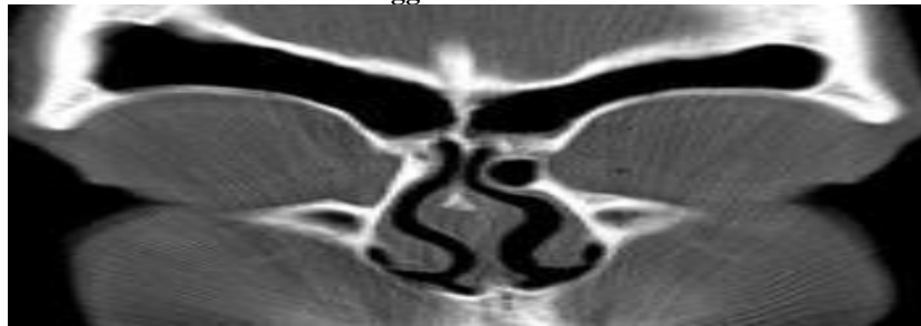
Fig - 4

Aggar nasi cells (Fig – 4) lie just anterior to the anterosuperior attachment of the middle turbinate and frontal recess. These can invade the lacrimal bone or the ascending process of maxilla. These cells were observed in 8% of patients in our study. Similar results were observed by Liu X et al., (12) and Llyod et al., (28) who reported the prevalence of aggar nasi cells as 7.8% and 8.5% in chronic rhinosinusitis cases whereas in the study by Dua et al., (6) agger nasi cells were found to be present in 9 patients(8%). The prevalence is very less as compared to 98.5% by Bolger (7), 88.5% by Maru(25), 86.7% by Tonai and Baba (32) and 48% by Asruddin(19).